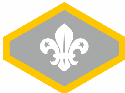
Chief Scout's Silver Award

For positioning of badges on uniform see page 8.