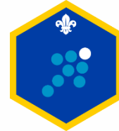
Team Leader Challenge